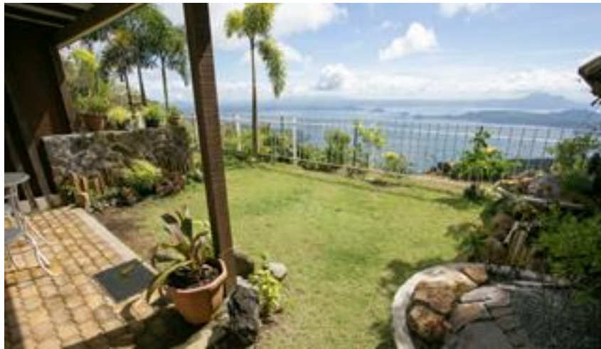
Figure 3. The Joaquin Bed and Breakfast.