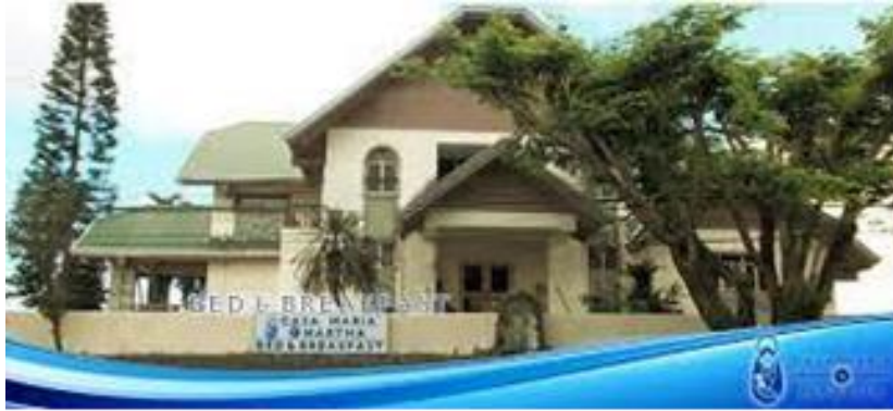
Figure 2. The Casa Maria y Martha Bed and Breakfast.